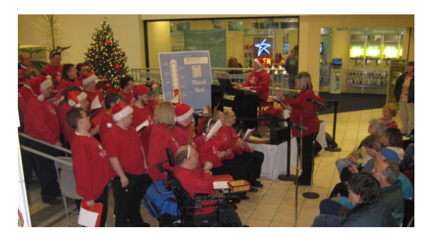
Grant To Very Special Arts

An endowment fund can support the charity or charities you currently give to, it can also support a field of interest (Youth, poor and needy, arts, elderly. scholarship, etc), or you can create a fund that is unrestricted. Unrestricted Funds are granted at the discretion of the Fond du Lac Area Foundation's Board of Directors who determine where the most needs are in the community. These funds offer great flexibility in meeting existing and future needs in the community.